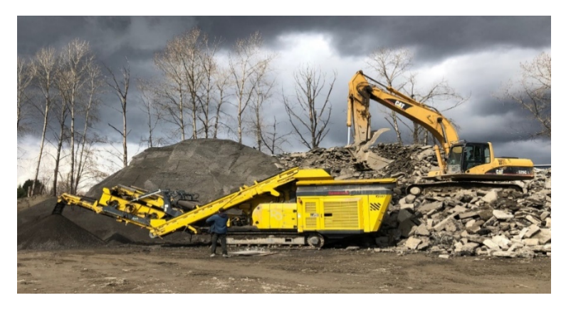
Site Civil Services