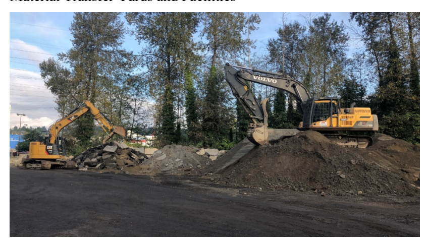
Material Transfer Yards and Facilities